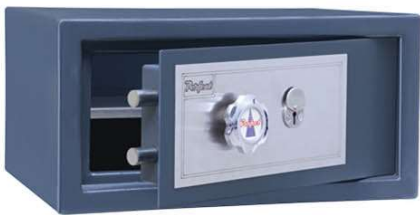
09"H x 18"W x 14"D 23KG