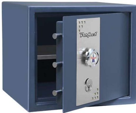
12"H x 14"W x 12"D 21KG