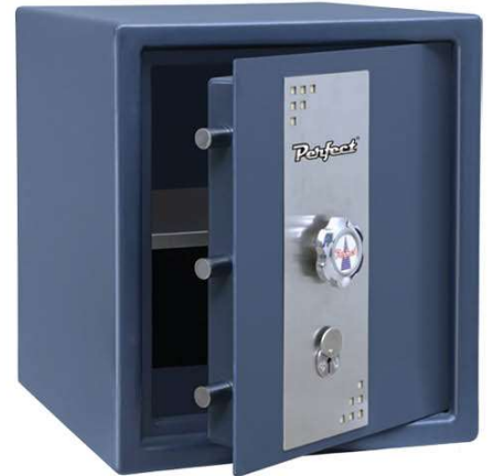
17"H x 15"W x 15"D 34KG