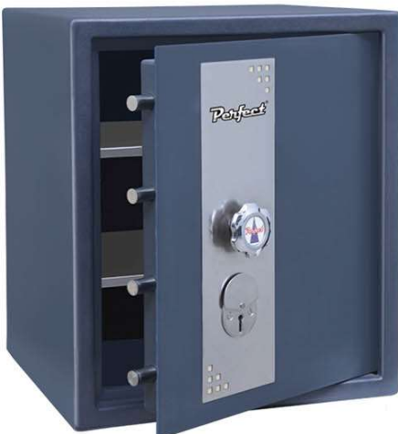
21"H x 18"W x 15"D 44KG