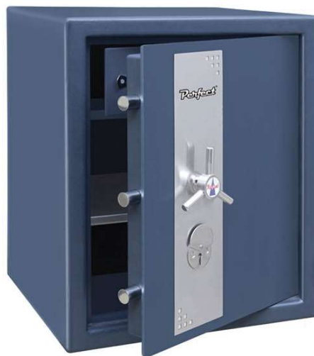
24"H x 20"W x 18"D 81KG