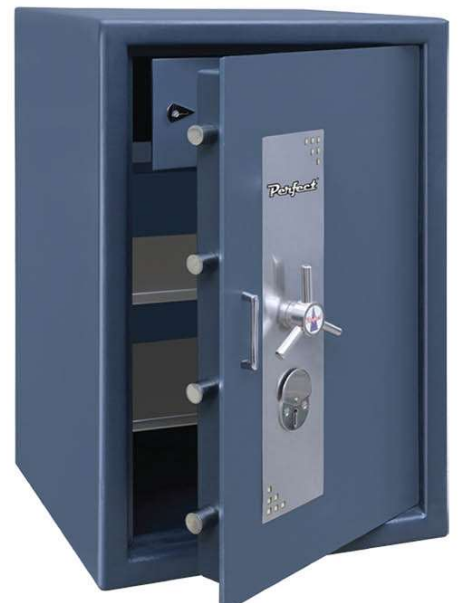
30"H x 20"W x 18"D 100KG